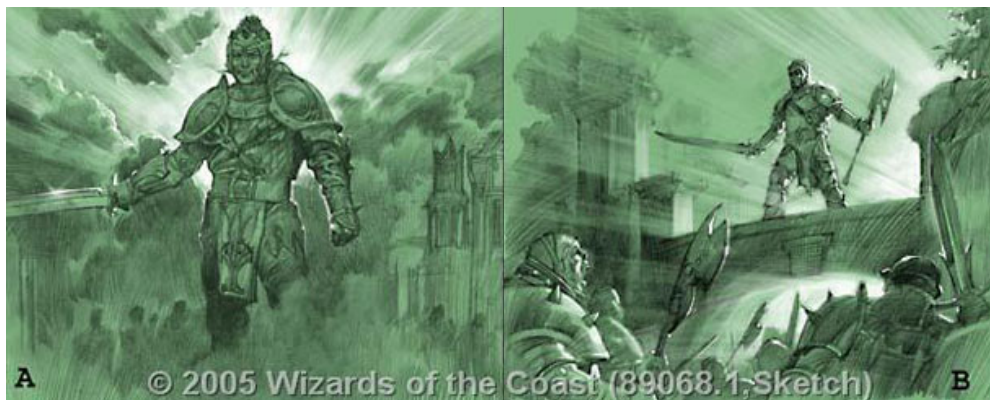
Sketches by Zoltan Boros & Gabor Szikszai

For each pair of sketches, decide which one ended up on the finished card. Click one side or the other to reveal whether you guessed right.