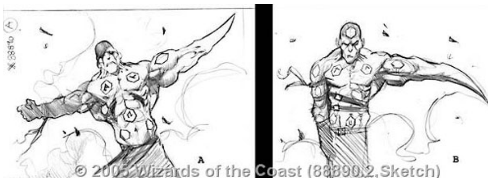
Sketches by Paolo Parente