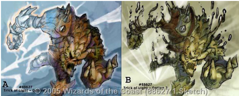
Sketches by Ron Spears